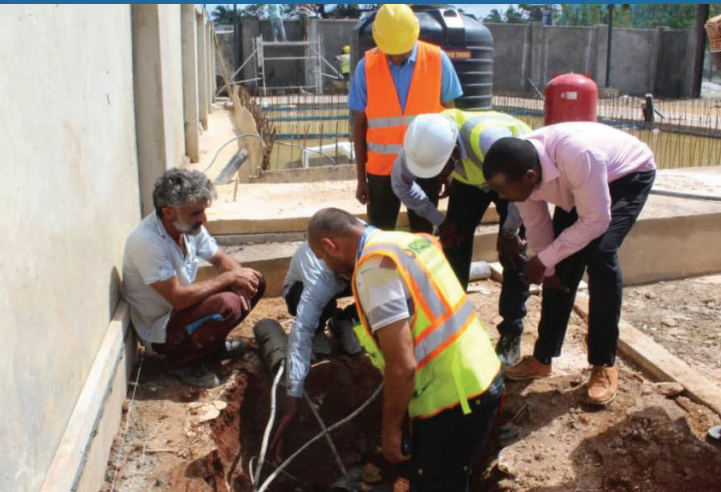
Fiber Expert team inspect existing Route at New Amani Stadium.

To secure the connection between the user's client and the company's server, we apply and design VPN is based on communication taking place on Layer 2 and Layer 3.