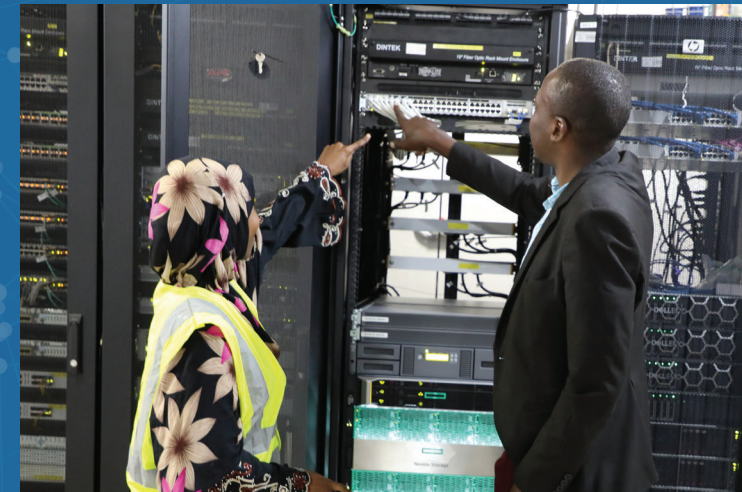
Data Engineers Perform Regular checks (Preventative Maintenance) at Zanzibar Tier III Data Centre.